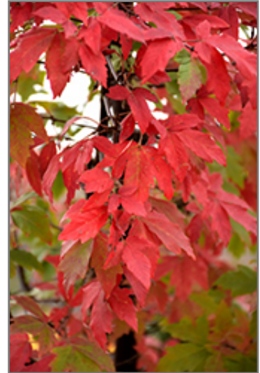
Paperbark Maple in fall

This tree does best in full sun to partial shade. It prefers to grow in average to moist conditions, and shouldn't be allowed to dry out. It is not particular as to soil type or pH. It is somewhat tolerant of urban pollution. This species is not originally from North America.