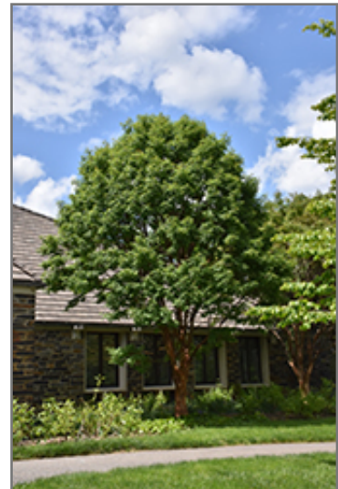
Paperbark Maple