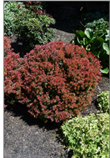
Golden Ruby Barberry