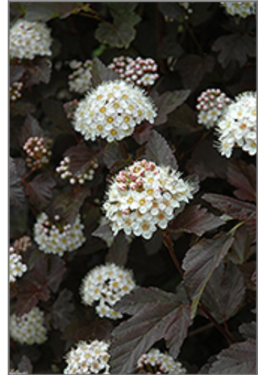
Diablo Ninebark flowers

Diablo Ninebark is recommended for the following landscape applications;