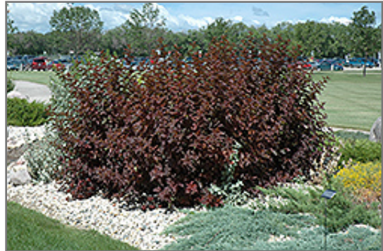
Diablo Ninebark