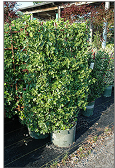
Manhattan Spreading Euonymus