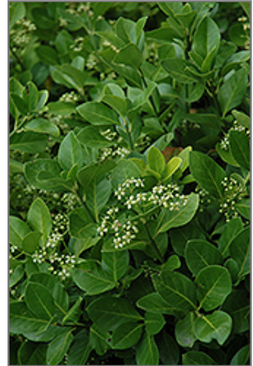
Manhattan Spreading Euonymus flowers

This shrub performs well in both full sun and full shade. It is very adaptable to both dry and moist locations, and should do just fine under average home landscape conditions. It is not particular as to soil type or pH. It is highly tolerant of urban pollution and will even thrive in inner city environments, and will benefit from being planted in a relatively sheltered location. This is a selected variety of a species not originally from North America.