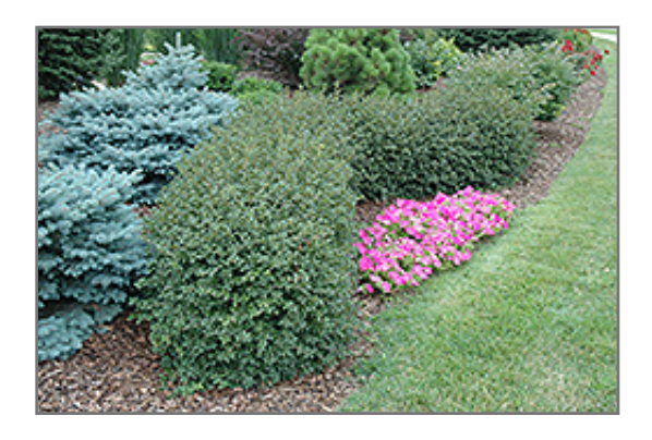
Green Mound Alpine Currant