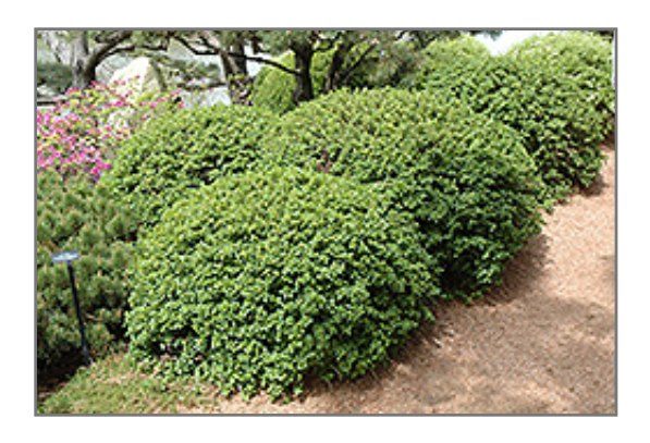
Green Mound Alpine Currant

Green Mound Alpine Currant will grow to be about 3 feet tall at maturity, with a spread of 24 inches. It tends to fill out right to the ground and therefore doesn't necessarily require facer plants in front. It grows at a medium rate, and under ideal conditions can be expected to live for approximately 30 years.