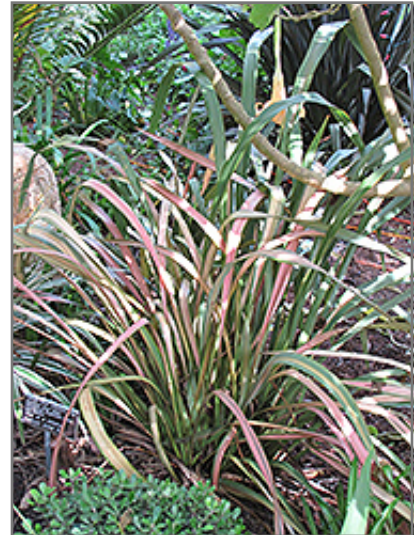
Jester New Zealand Flax