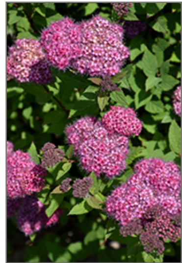
Double Play Artisan Spirea flowers

Double Play Artisan Spirea is recommended for the following landscape applications;