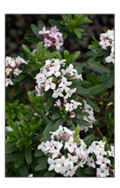
Eternal Fragrance Daphne flowers

Eternal Fragrance Daphne has clusters of fragrant white tubular flowers with shell pink throats at the ends of the branches from late spring to early fall. It has dark green evergreen foliage which emerges light green in spring. The narrow leaves remain dark green throughout the winter.