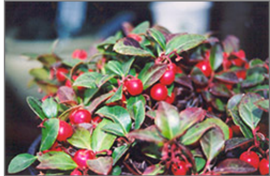
Creeping Wintergreen fruit

Creeping Wintergreen is recommended for the following landscape applications;