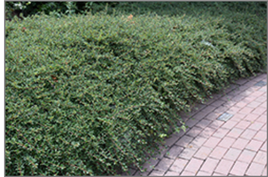
Coral Beauty Cotoneaster