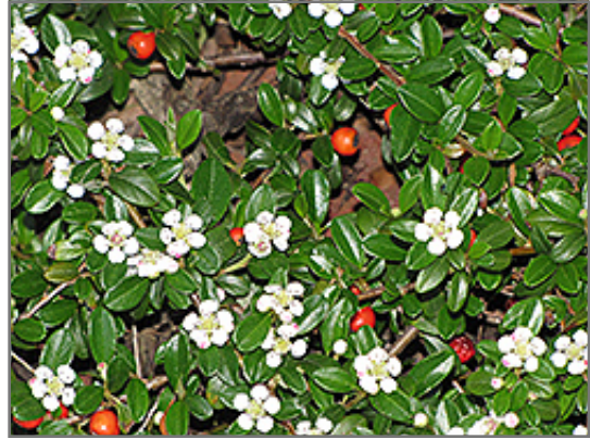
Coral Beauty Cotoneaster fruit

Coral Beauty Cotoneaster will grow to be about 12 inches tall at maturity, with a spread of 5 feet. It tends to fill out right to the ground and therefore doesn't necessarily require facer plants in front. It grows at a fast rate, and under ideal conditions can be expected to live for approximately 30 years.