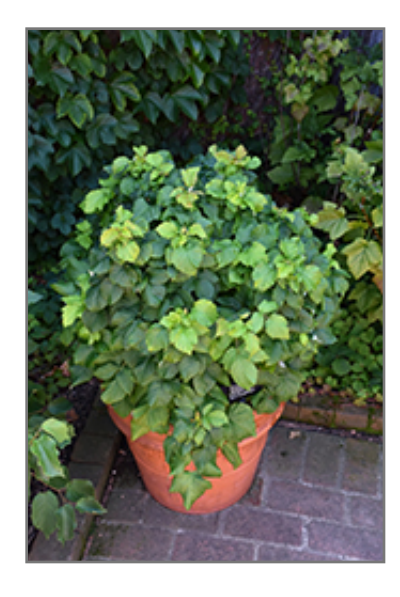
Raspberry Shortcake Raspberry