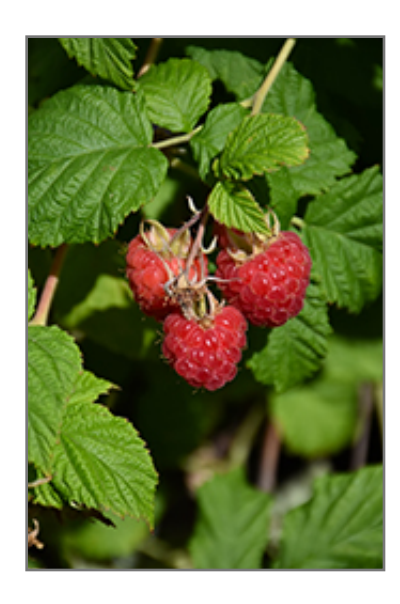
Raspberry Shortcake Raspberry fruit

Raspberry Shortcake Raspberry has rich green deciduous foliage on a plant with an upright spreading habit of growth. The textured oval compound leaves do not develop any appreciable fall color. It features an abundance of magnificent red berries in mid summer.