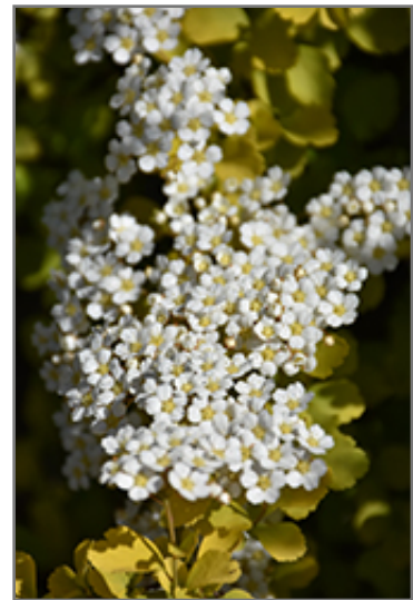
Glow Girl Birch Leaf Spirea flowers