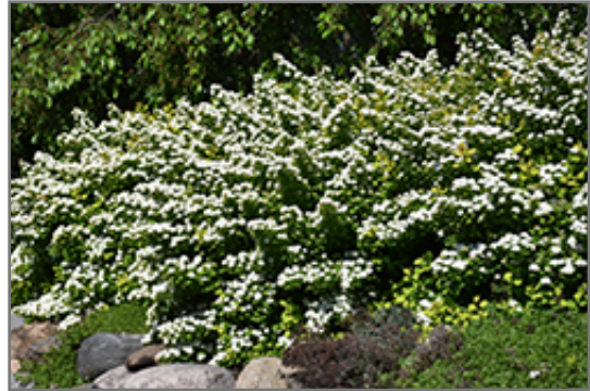
Glow Girl Birch Leaf Spirea in bloom