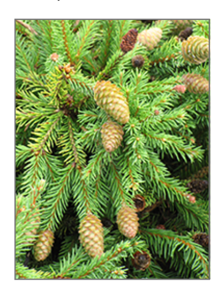
Pusch Spruce foliage