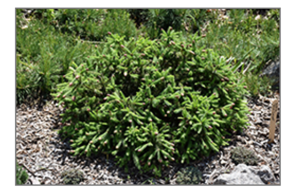
Pusch Spruce