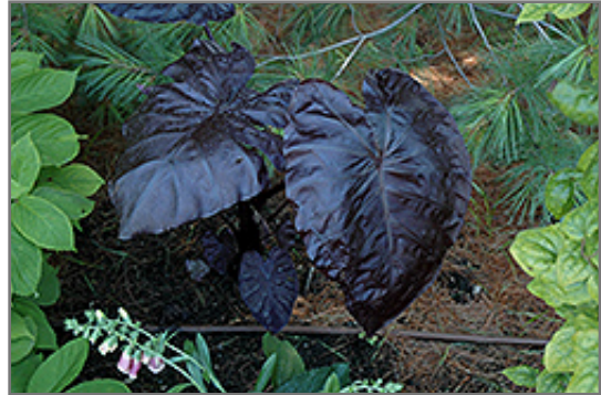
Royal Hawaiian Black Coral Elephant Ear