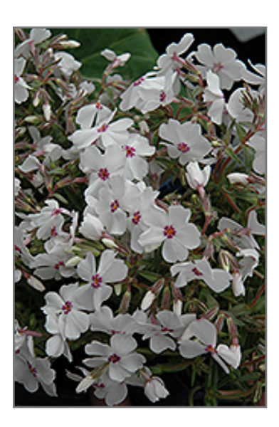
Amazing Grace Moss Phlox flowers

This variety produces a showy display of bright white flowers with golden centers surrounded by maroon-pink spots; prune lightly after flowering to encourage a dense growth habit; wonderful for rock gardens, edging, or in mixed containers