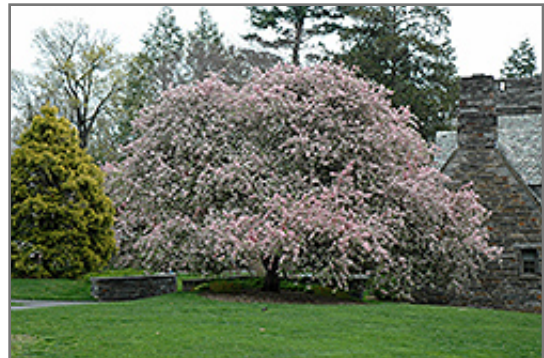
Japanese Flowering Crab in bloom