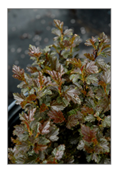
Tiny Wine Ninebark foliage