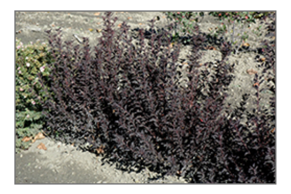
Tiny Wine Ninebark

This shrub does best in full sun to partial shade. It is very adaptable to both dry and moist locations, and should do just fine under average home landscape conditions. It is not particular as to soil type or pH. It is highly tolerant of urban pollution and will even thrive in inner city environments. This is a selection of a native North American species.