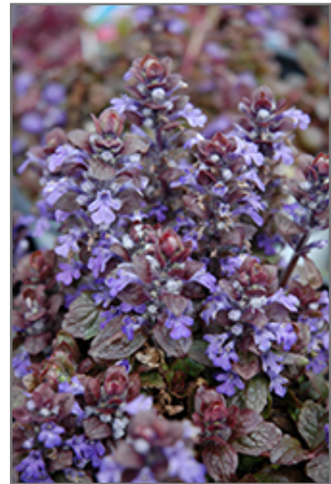
Bronze Beauty Bugleweed flowers

Bronze Beauty Bugleweed is recommended for the following landscape applications;