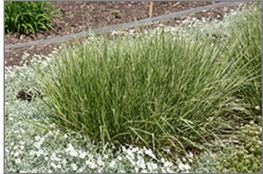
Variegated Reed Grass

Variegated Reed Grass is a fine choice for the garden, but it is also a good selection for planting in outdoor pots and containers. With its upright habit of growth, it is best suited for use as a 'thriller' in the 'spiller-thriller-filler' container combination; plant it near the center of the pot, surrounded by smaller plants and those that spill over the edges. It is even sizeable enough that it can be grown alone in a suitable container. Note that when growing plants in outdoor containers and baskets, they may require more frequent waterings than they would in the yard or garden.