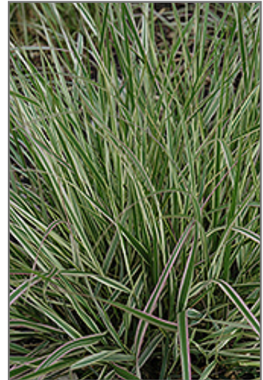
Variegated Reed Grass foliage