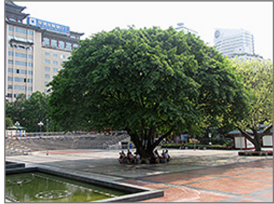
Indian Laurel Fig

This is a multi-stemmed evergreen houseplant with a more or less rounded form. This plant may benefit from an occasional pruning to look its best.