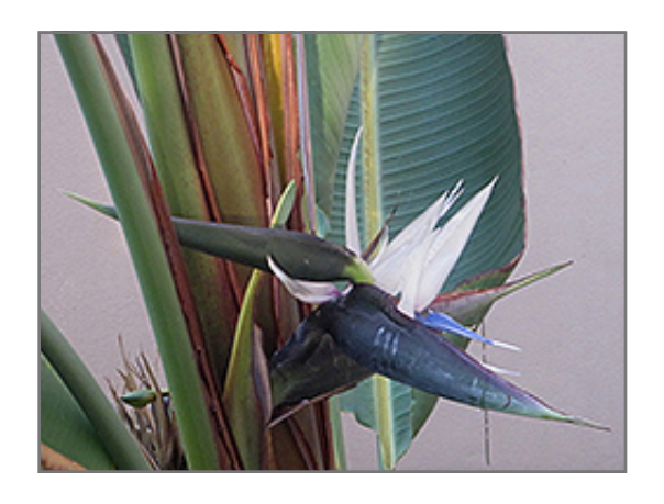
White Bird Of Paradise flowers

This is a multi-stemmed evergreen houseplant with an upright spreading habit of growth. Its wonderfully bold, coarse texture is quite ornamental and should be used to full effect. You may trim off the flower heads after they fade and die to encourage releat blooming.