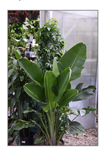
White Bird Of Paradise