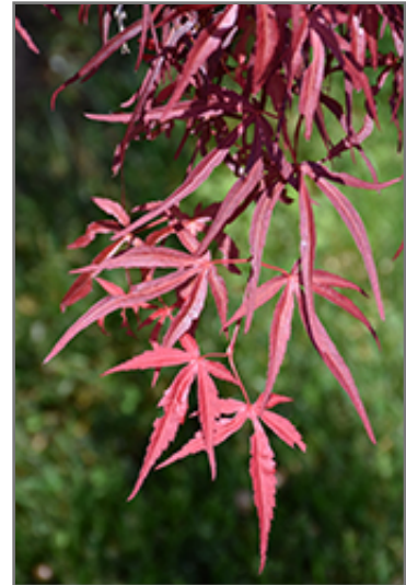
Red Spider Japanese Maple foliage