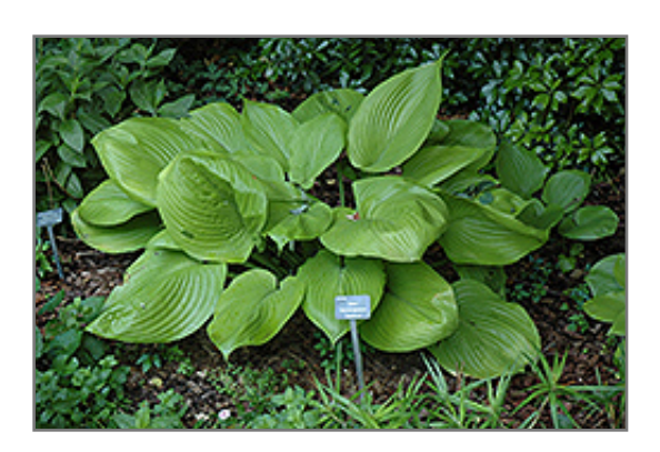
Sum and Substance Hosta foliage

Sum and Substance Hosta is recommended for the following landscape applications;