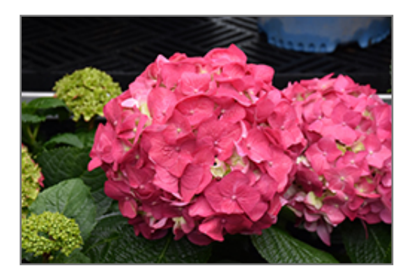
Summer Crush Hydrangea flowers