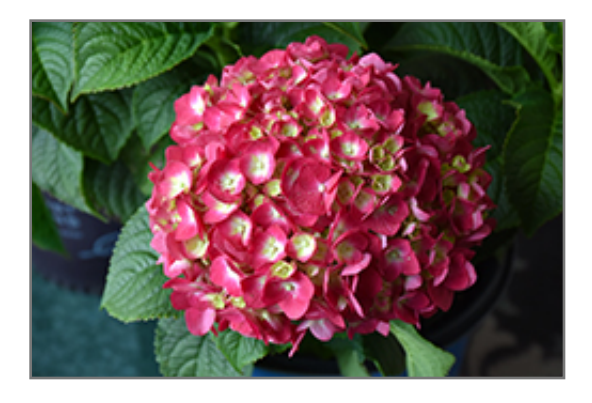
Summer Crush Hydrangea flowers