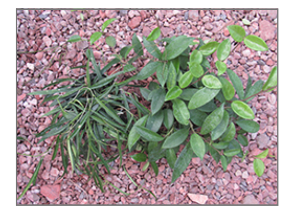
Jade Wax Plant