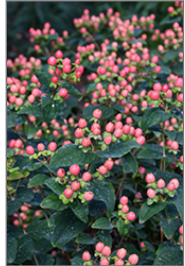
FloralBerry Rosé St. John's Wort fruit

FloralBerry Rosé St. John's Wort is recommended for the following landscape applications;