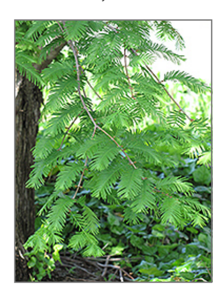
Dawn Redwood foliage