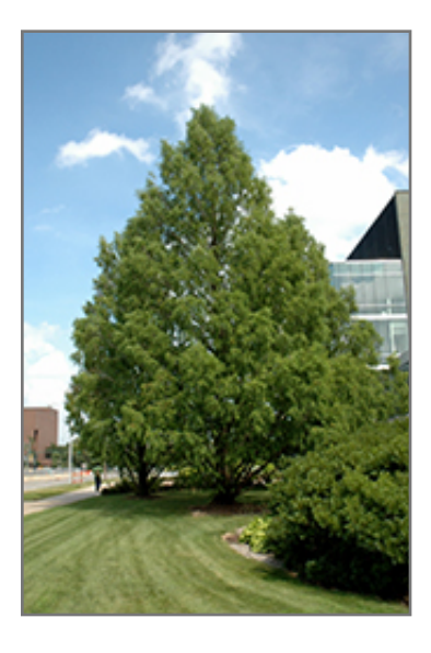
Dawn Redwood