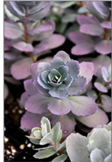
Plum Dazzled Stonecrop foliage