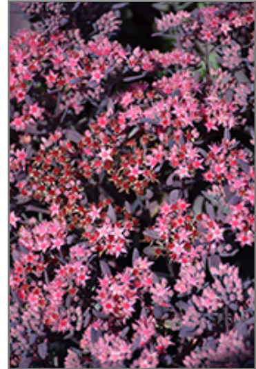
Plum Dazzled Stonecrop flowers

Plum Dazzled Stonecrop is a dense herbaceous perennial with an upright spreading habit of growth. Its medium texture blends into the garden, but can always be balanced by a couple of finer or coarser plants for an effective composition.