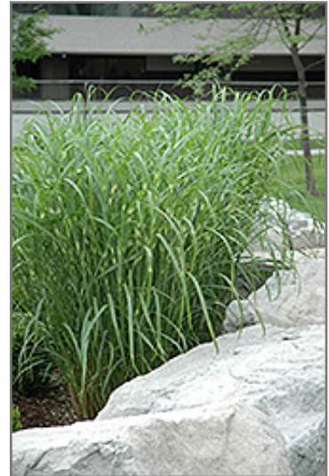
Zebra Grass