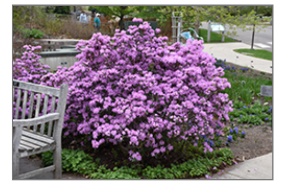
P.J.M. Rhododendron in bloom

P.J.M. Rhododendron is recommended for the following landscape applications;