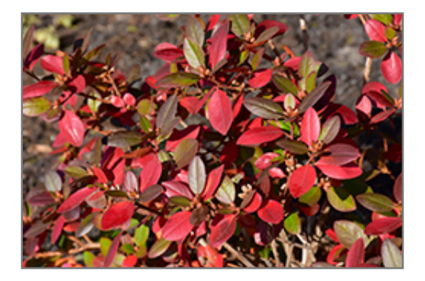
P.J.M. Rhododendron in fall

This shrub does best in full sun to partial shade. You may want to keep it away from hot, dry locations that receive direct afternoon sun or which get reflected sunlight, such as against the south side of a white wall. It requires an evenly moist well-drained soil for optimal growth, but will die in standing water. It is very fussy about its soil conditions and must have rich, acidic soils to ensure success, and is subject to chlorosis (yellowing) of the foliage in alkaline soils. It is somewhat tolerant of urban pollution, and will benefit from being planted in a relatively sheltered location. Consider applying a thick mulch around the root zone in winter to protect it in exposed locations or colder microclimates. This particular variety is an interspecific hybrid.