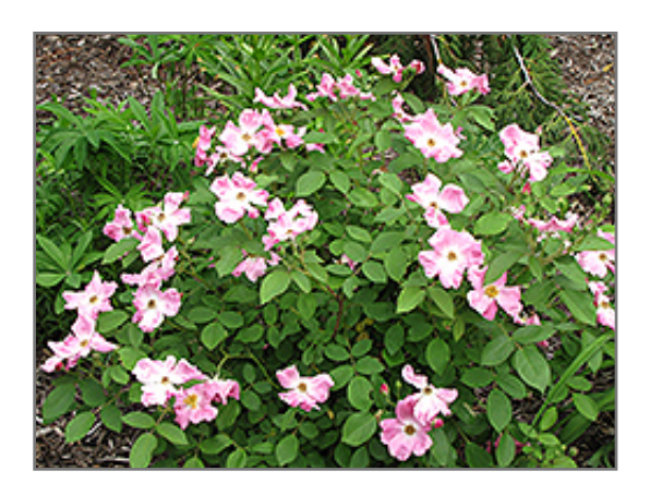
Rugosa Rose in bloom