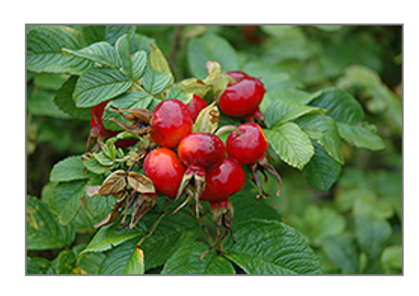
Rugosa Rose fruit