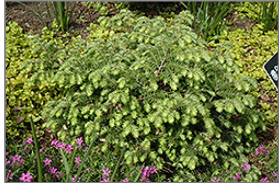
Moon Frost Hemlock

Moon Frost Hemlock is recommended for the following landscape applications;