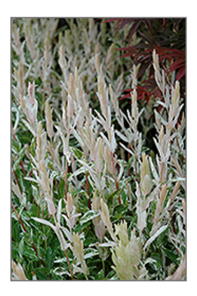
Tricolor Willow foliage