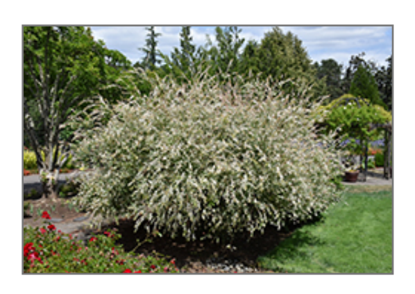
Tricolor Willow