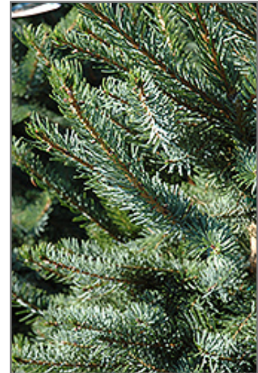
Brun's Spruce foliage