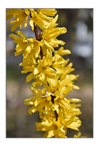
Lynwood Gold Forsythia flowers