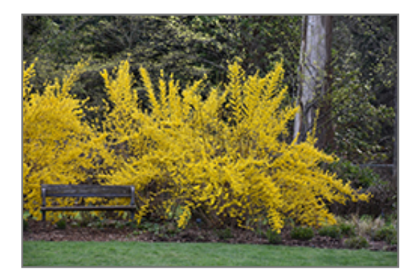
Lynwood Gold Forsythia in bloom

Lynwood Gold Forsythia is recommended for the following landscape applications;