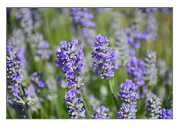
Munstead Lavender flowers

Munstead Lavender has masses of beautiful spikes of fragrant purple flowers rising above the foliage from early to late summer, which are most effective when planted in groupings. The flowers are excellent for cutting. It has attractive grayish green evergreen foliage. The fragrant needles are highly ornamental and turn coppery-bronze in the fall, which persists throughout the winter.