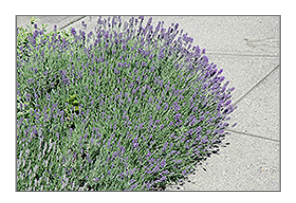
Munstead Lavender in bloom