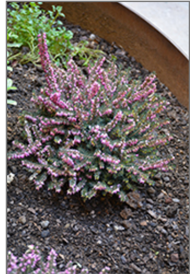
Mediterranean Pink Heath in bloom