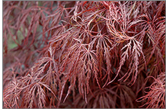
Crimson Queen Japanese Maple foliage

Crimson Queen Japanese Maple is recommended for the following landscape applications;