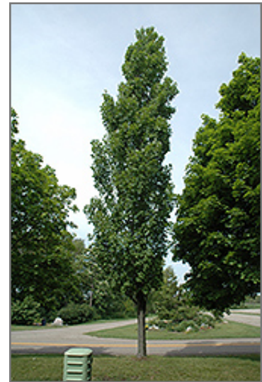
Armstrong Maple