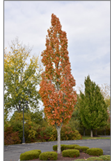
Armstrong Maple in fall

This tree should only be grown in full sunlight. It is quite adaptable, preferring to grow in average to wet conditions, and will even tolerate some standing water. It is not particular as to soil type or pH. It is highly tolerant of urban pollution and will even thrive in inner city environments. This particular variety is an interspecific hybrid.