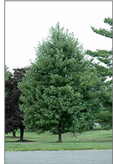
October Glory Red Maple