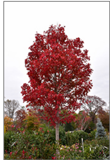
October Glory Red Maple in fall