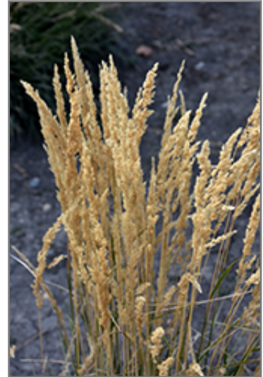
El Dorado Feather Reed Grass fruit

El Dorado Feather Reed Grass is a fine choice for the garden, but it is also a good selection for planting in outdoor pots and containers. Because of its height, it is often used as a 'thriller' in the 'spiller-thriller-filler' container combination; plant it near the center of the pot, surrounded by smaller plants and those that spill over the edges. It is even sizeable enough that it can be grown alone in a suitable container. Note that when growing plants in outdoor containers and baskets, they may require more frequent waterings than they would in the yard or garden.