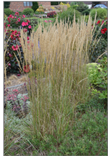
El Dorado Feather Reed Grass