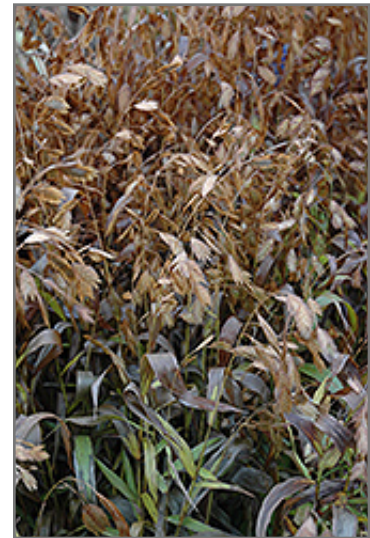
Northern Sea Oats in fall

Northern Sea Oats is recommended for the following landscape applications;