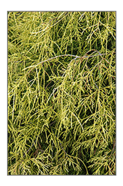
Sungold Falsecypress foliage

This is a relatively low maintenance shrub. When pruning is necessary, it is recommended to only trim back the new growth of the current season, other than to remove any dieback. It has no significant negative characteristics.