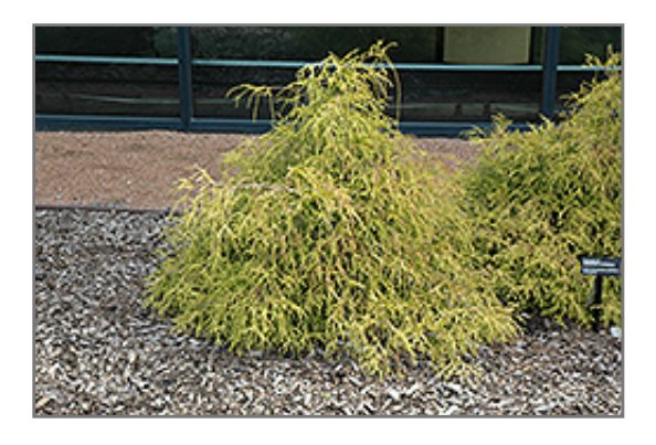
Sungold Falsecypress

Sungold Falsecypress is recommended for the following landscape applications;