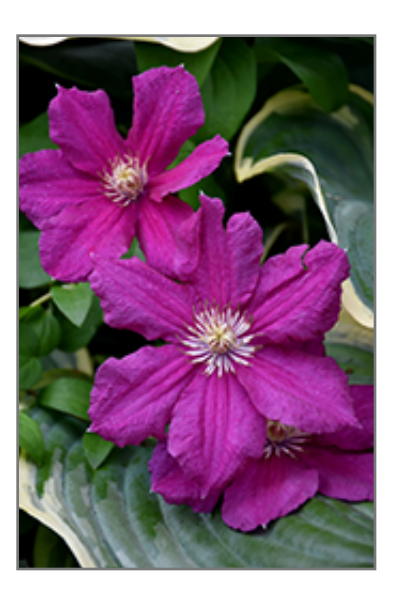
Ernest Markham Clematis flowers