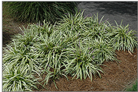
Variegata Lily Turf in bloom