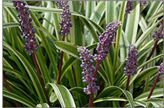
Variegata Lily Turf flowers

Variegata Lily Turf is recommended for the following landscape applications;