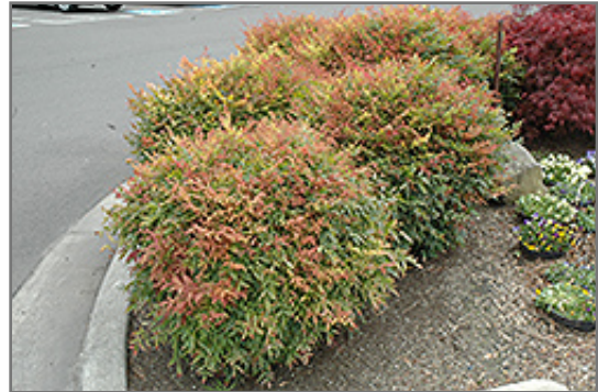
Sienna Sunrise Nandina