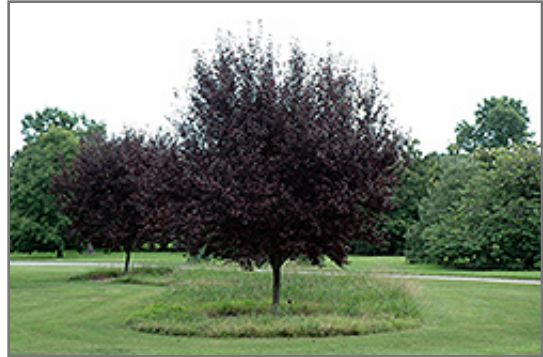
Krauter Vesuvius Plum

This tree should only be grown in full sunlight. It does best in average to evenly moist conditions, but will not tolerate standing water. It is not particular as to soil type or pH. It is highly tolerant of urban pollution and will even thrive in inner city environments. This is a selected variety of a species not originally from North America.