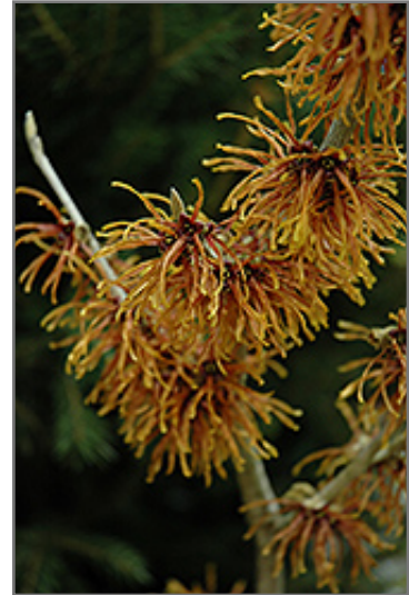
Jelena Witchhazel flowers

Jelena Witchhazel is recommended for the following landscape applications;