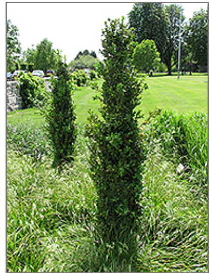
Graham Blandy Boxwood