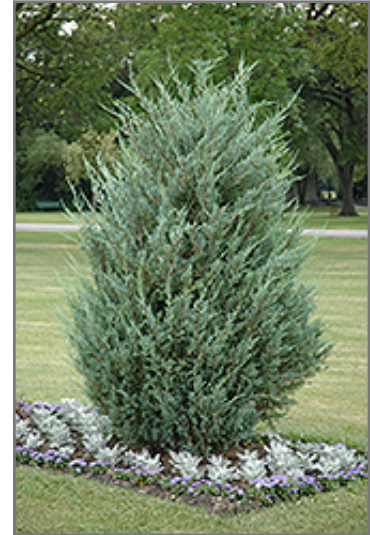
Moonglow Juniper